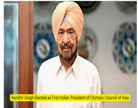
Randhir Singh Elected as First Indian President of Olympic Council of Asia

(C) Veteran sports announcer Randhir Singh is set to be elected the first Indian president of the Olympic Council of Asia at the 44th general assembly of the Asian body. Former Indian shooter Randhir Singh will be officially named the OASIA president in the presence of Sports Minister Mansukh Mandaviya and top officials from all 45 Asian countries.